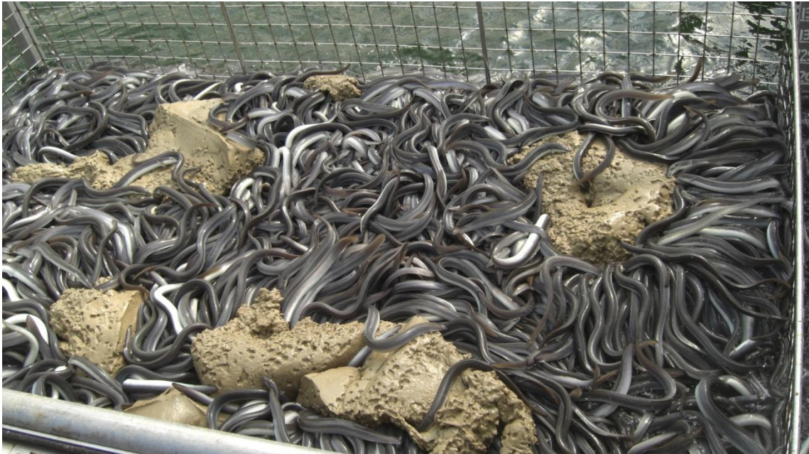
Eel is being fed at Yamada Suisan, Kagoshima.