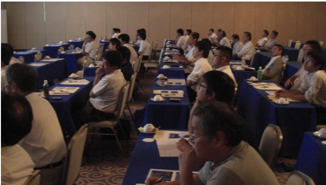
Seminar in Kagoshima